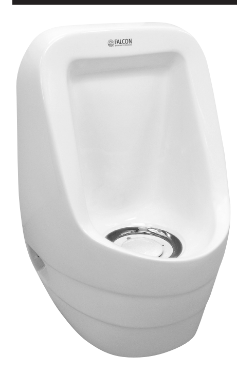
WATERFREE URINAL VITREOUS CHINA